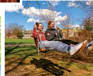
▲ Swings Initiative